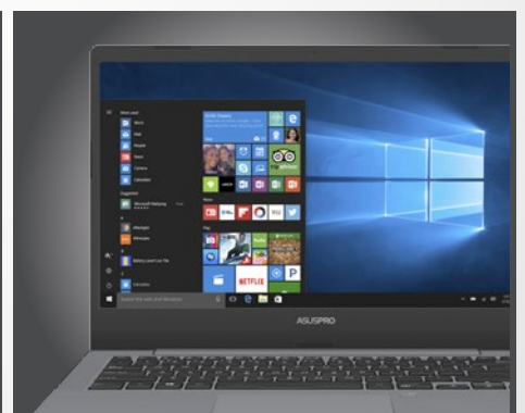
Long-lasting battery life of 10 hours