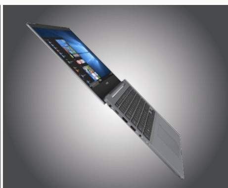
Flexible 180-degree hinge