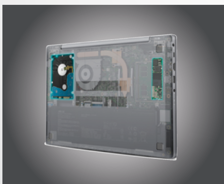
Dual storage options of SSD and HDD

Illuminated chiclet keyboard, full-sized 19.05mm pitch, spill-resistant, 1.5mm travel distance